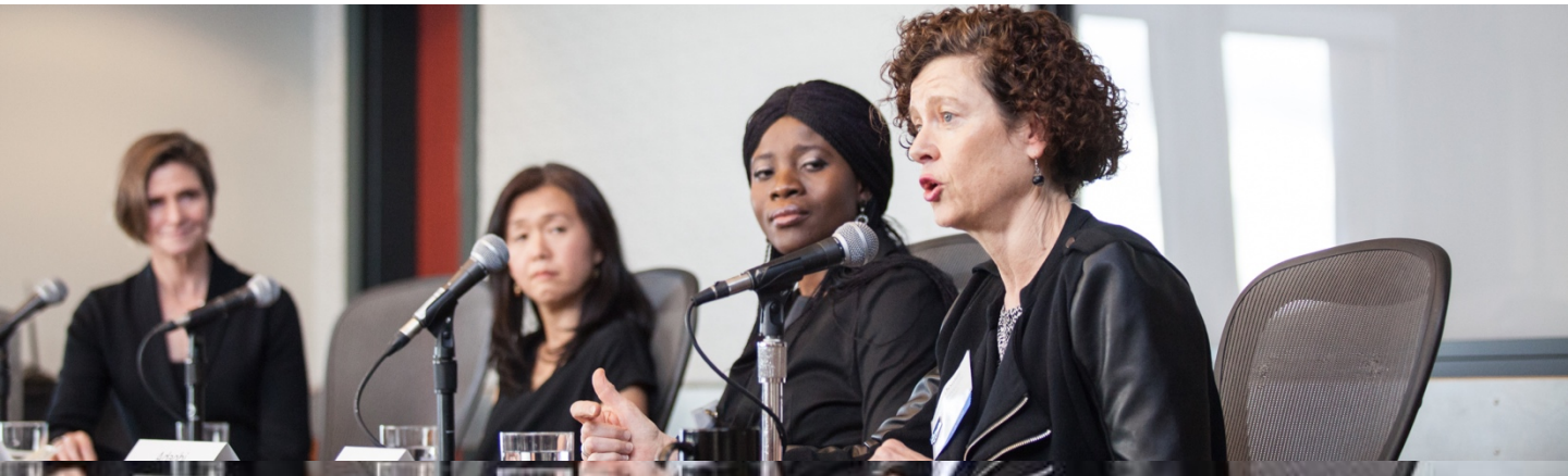
Panel session, “Authentic Leadership Development.”