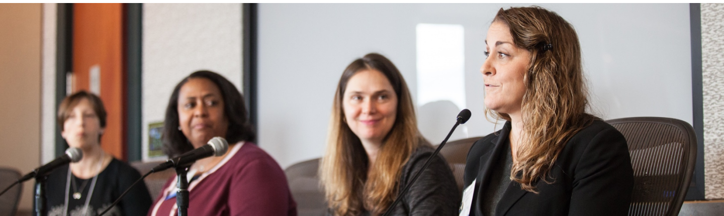
Panelists on “Big Bets for Global Goals.”