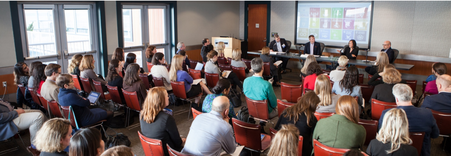
Panel Session, "Business Leaders Take a Stand for the Global Goals."