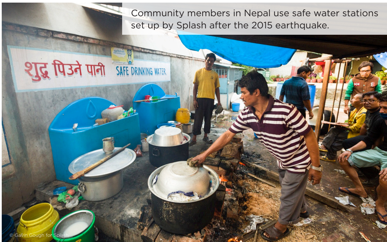
Community members in Nepal use safe water stations set up by Splash after the 2015 earthquake.

Splash is a nonprofit organization founded in 2007, implementing water, sanitation, and hygiene (WASH) solutions for children in urban Asia and Africa. The organization works in some of the fastest-growing cities in the world, where it focuses on child-serving institutions, including schools, orphanages, shelters, and hospitals, to help kids lead healthier lives. Splash's five-year goal is to reach 100 percent of government schools in Addis Ababa (Ethiopia), Kathmandu (Nepal), and Kolkata (India), benefitting 1 million children.