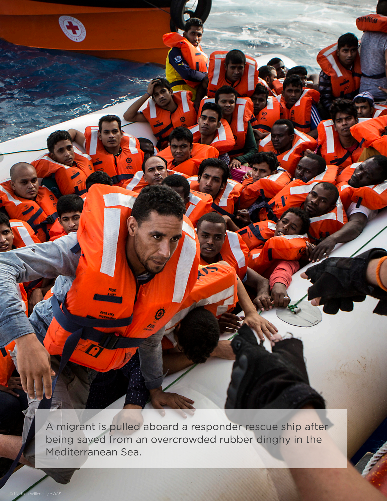
A migrant is pulled aboard a responder rescue ship after being saved from an overcrowded rubber dinghy in the Mediterranean Sea.