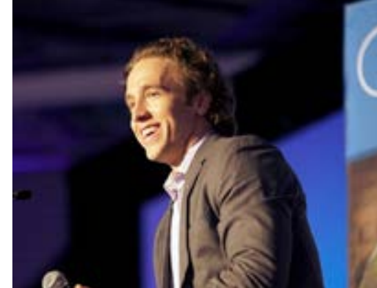
Craig Kielburger, founder of Free the Children and Me to We