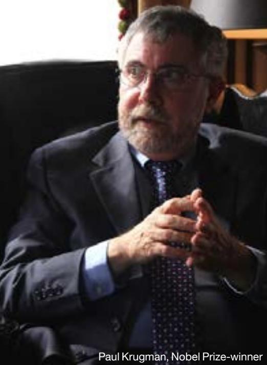
Paul Krugman, Nobel Prize-winner